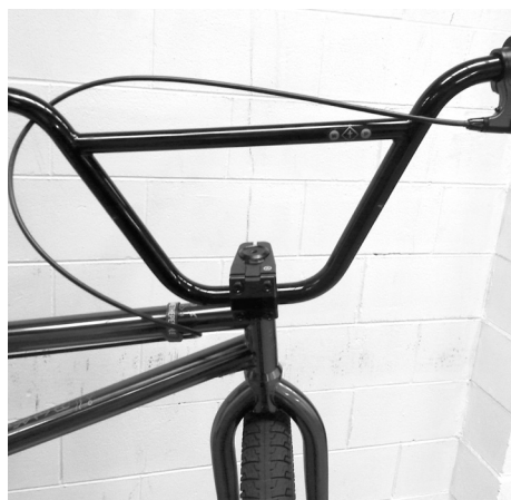
4. STEM STRAIGHT IN LINE WITH WHEEL