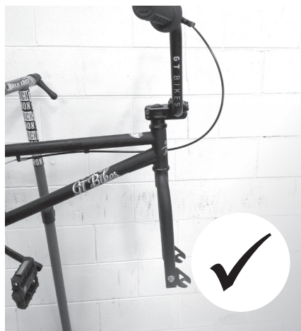
2. FORK RIGHT WAY AROUND