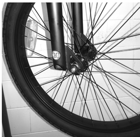
5. FRONT WHEEL IN AND TIGHTEN THE NUTS