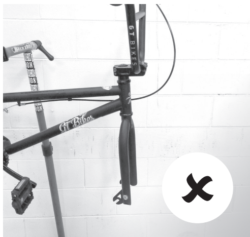
2. FORK WRONG WAY AROUND