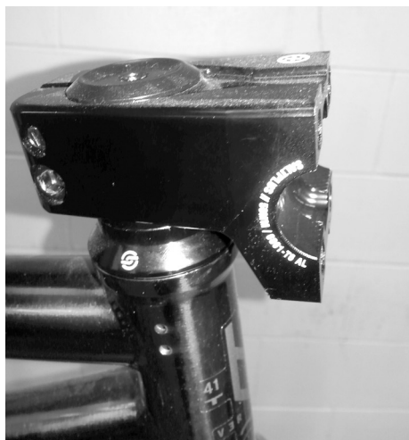
3. STEM PLATE OFF TO ATTACH HANDLE BARS