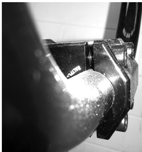
4. EVEN GAP TOP AND BOTTOM FOR THE BARS